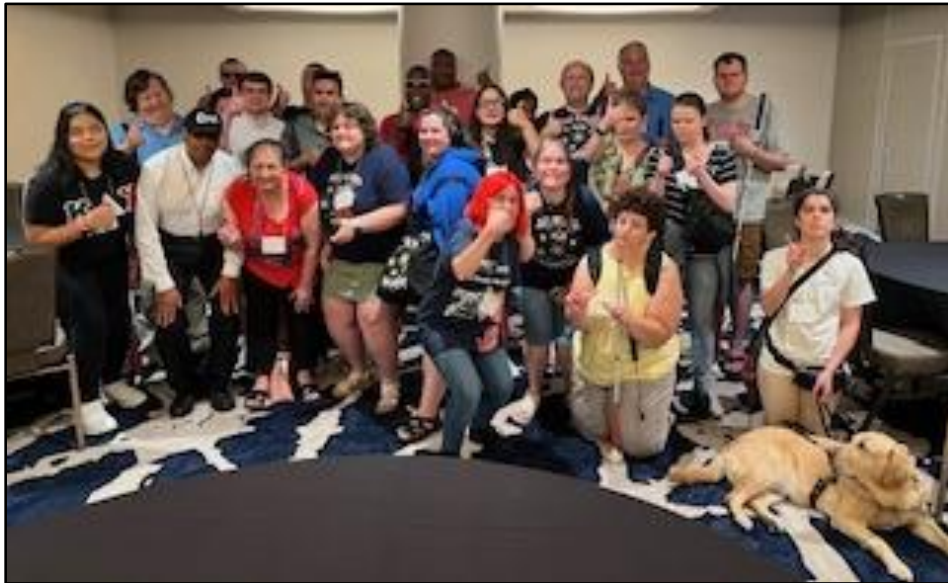
Photo Left: ACB Next Generation Pep Rally Group Photo