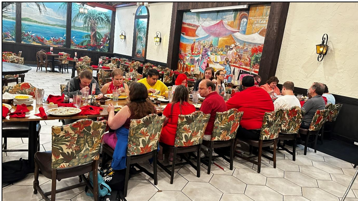
Photo Above: ACB Next Generation Breakfast Group Photo