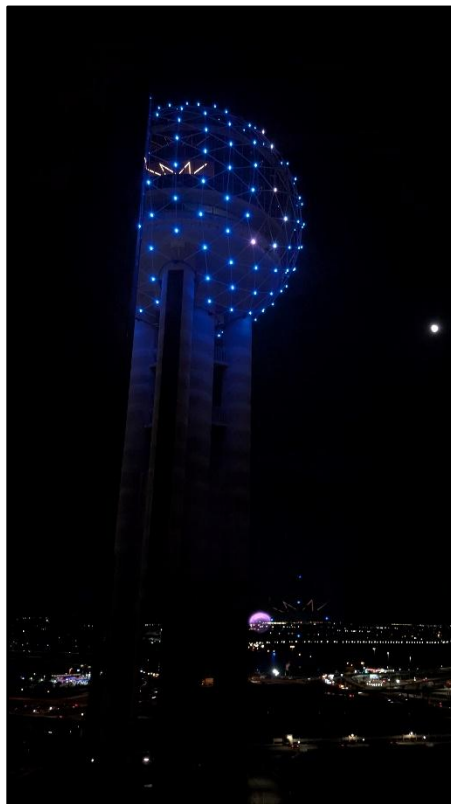
Photo Above Left: Reunion Tower and the Hyatt Regency Dallas. The hotel stairsteps down to the base of the tower and the tower rises up from the end. Photo Above Right: Reunion Tower at night with blue lights illuminated.